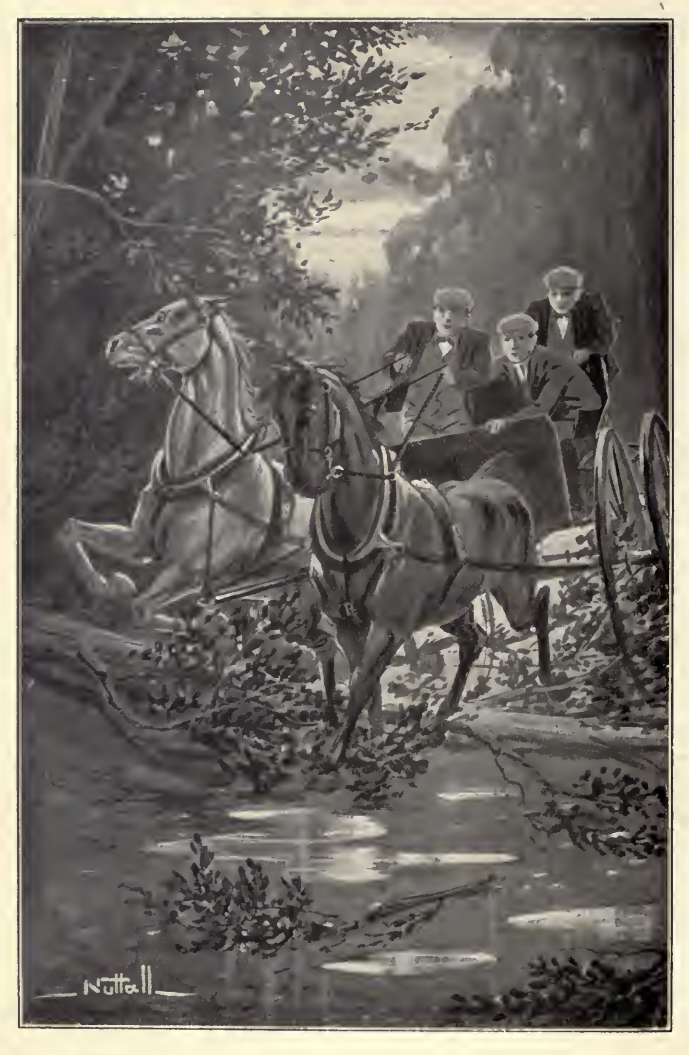
ONE HORSE REARED AND TRIED TO BACK. -Page 34. The Rover Boys on the Farm.